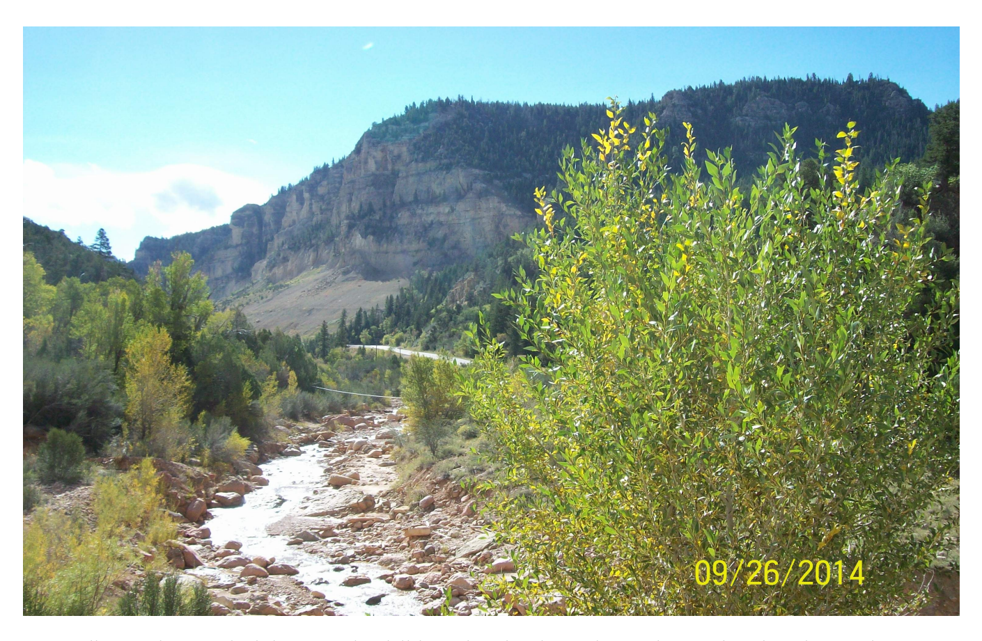
Appendix 1: Picture of Highway 14 landslide and rocks above the road east of Cedar City, Utah.