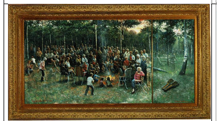
VI. Chapter: Living Location: Webster's Flat Family: Family Reunion Concept: Vail