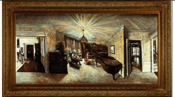
II. Chapter: Pre-Existence Location: Music Room Family: Eternal Perspective Concept: Heaven