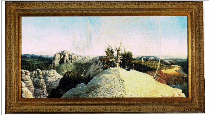
V. Chapter: Civilization Location: Landscape Monuments Family: Morning Prayer Concept: Milestones

Division 2. Body. Section A: Milestones. Section B: Connections. Section C: Work. Owner: Sara Ellyn Sulfwan Chapter: Dedication Location: Landscape Season: Spring Proventing Prayer 12 Scales 12 Scales