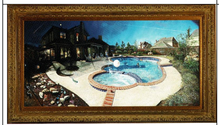
III. Chapter: Creation Location: Back Yard Family: Family Time Concept: Earth

Division 2. Body. Section A. Astrophysical. B. Geological Section C. Biological. Owner: Paul Frederick Nelson Type Garden View Chapter: Dedication Location: Back Yard Family: Family Time 180° View 1 Perspective 2 Scales