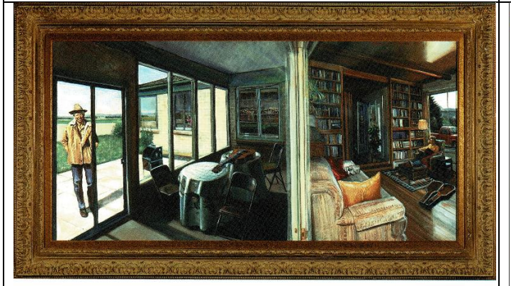
IV. Chapter: Mankind Location: Parent's Home Family: Workers and Thinkers Concept: Brain