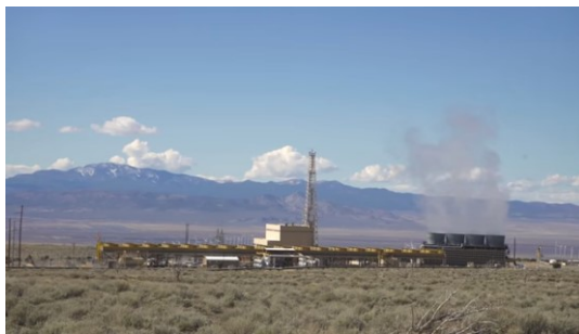
Photo of the Blundell Geothermal Plant