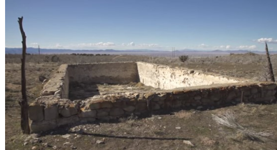
Pioneer Geothermal Swimming Pool north of the plant