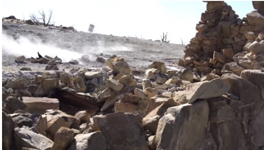
Geothermal Energy at the Surface