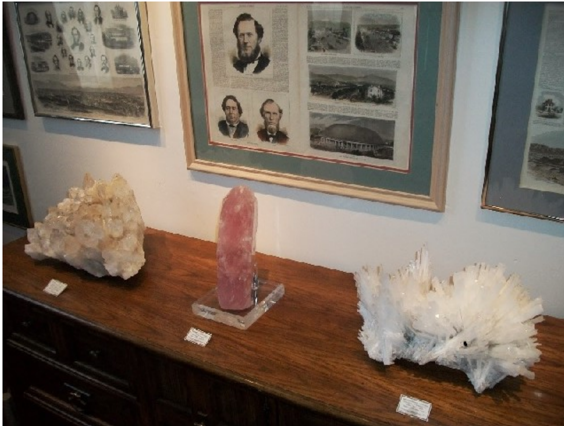
Three examples of minerals in the Milford Mineral Museum.

There are more different minerals in the Milford Mineral Museum than there are in the Houston Museum of Gems & Minerals.